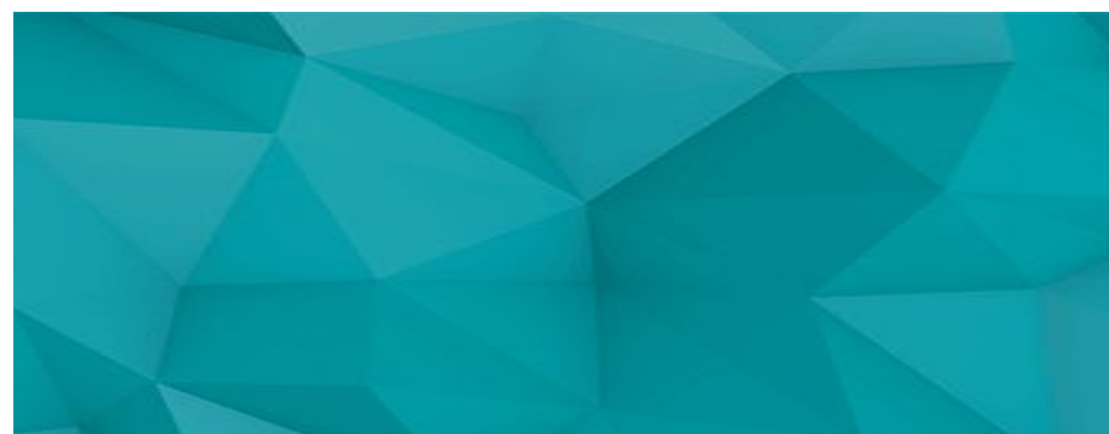
This is a caption. You can replace the image and edit this text here.

The font can be changed and you can pick any desired font in PowerPoint, Google Slides or Open Office. It is recommended to follow a consistency in Font, text size, captions, etc.