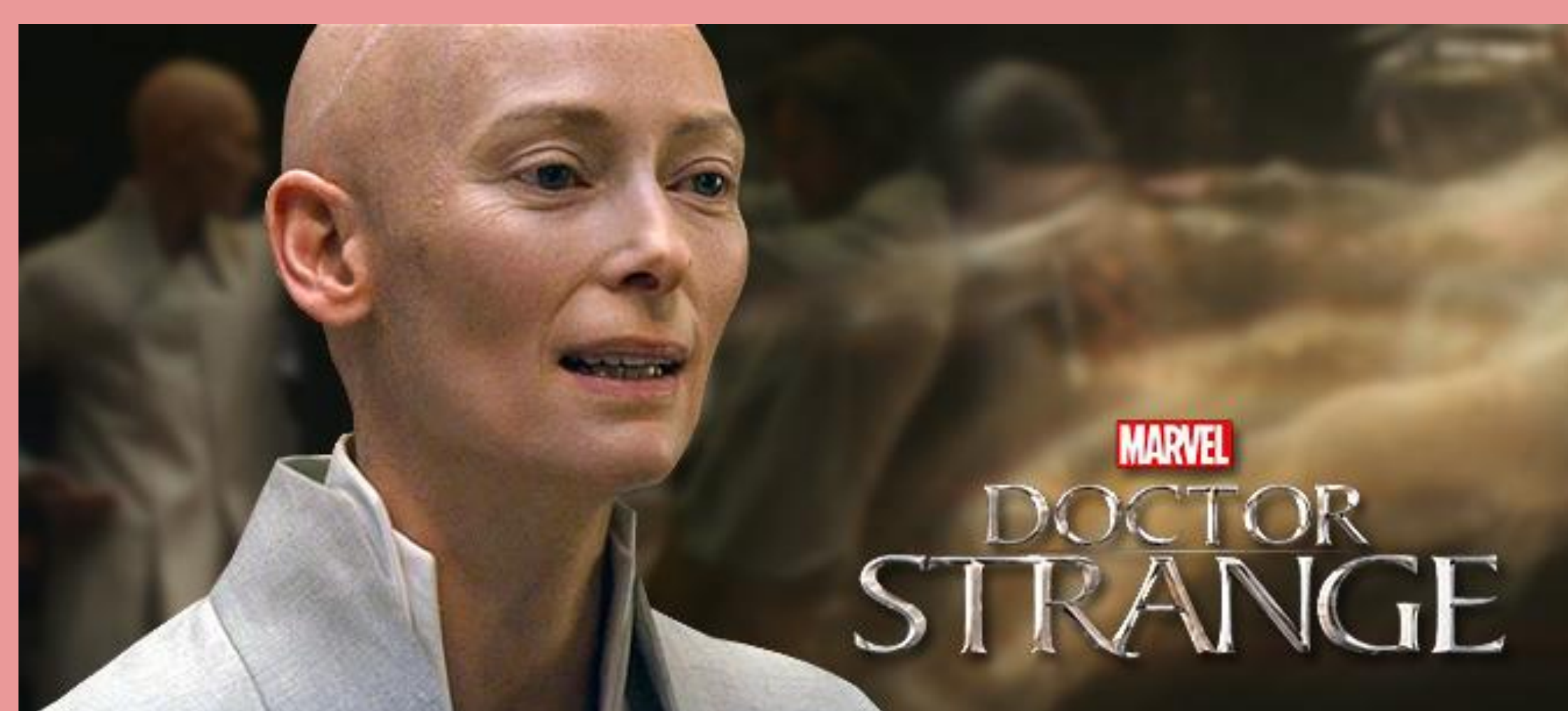
Tilda Swinton’s casting in the role of the Ancient One, in the film Doctor Strange, raised controversy after the film’s release. The role was a Tibetan monk.

A possible cause of this problem is the way we as audience members believe that people should be cast based on the exact description of the character that is provided by the writer, and that no other person can be fit to play the role. The theatre and film industries are already highly competitive, but aspiring Asian and Asian American actors face a much harder challenge to be a part of these industries due to the lack of roles for people coming from this background. There are many notable roles out there which an Asian or Asian American actor could play; however, these roles are often given to actors from a White background. This phenomenon is also known as “whitewashing.” Whitewashing in this context refers to the portrayal of Asian characters by white actors. Another form of whitewashing takes place when white actors replace or rewrite limited “Asian” roles.